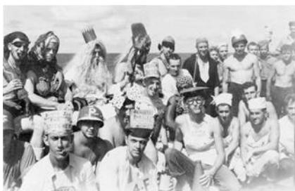
King Neptune's Court crossing the Equator.