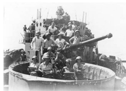
The forward 40mm gun mount and crew.