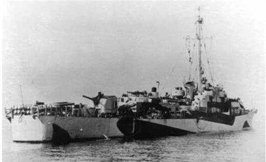
The USS Dennis in circa 1944 Pacific Theater camouflage.