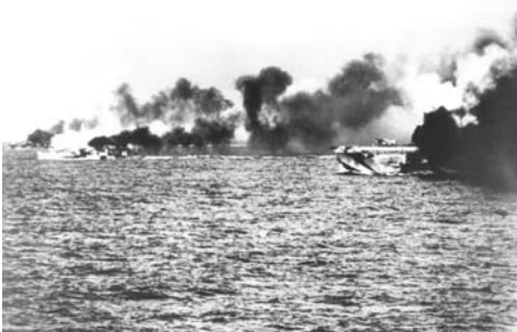
The Gambier Bay (right) making smoke along with other Taffy III vessels early in the battle.

In spite of the gritty courage being shown by the U.S. tin cans and Navy fliers, the Japanese continued to press home their attack, and eventually began to find the range. The USS Gambier