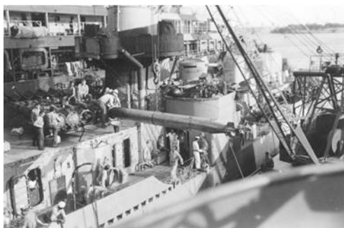
Loading torpedoes aboard a Fletcher class destroyer.