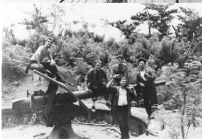
Spoils of war. A Japanese gun emplacement.