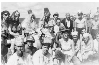
King Neptune's Court crossing the Equator.