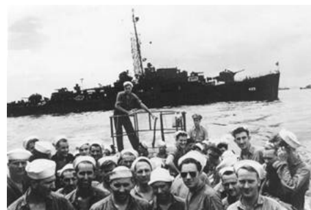
Heading for some R&R on Eniwetok.