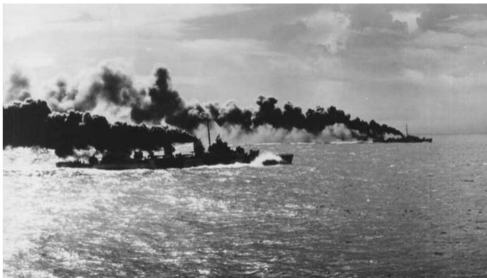
The USS Heermann (foreground) and USS Dennis early in the battle making smoke. Note the bow wave on the Heermann .