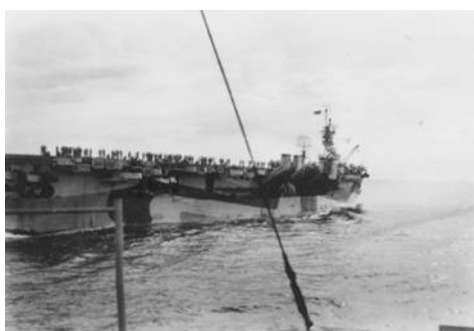
Dennis approaches an Independence class CVL. These carriers were originally going to be light cruisers, but were changed before completion.