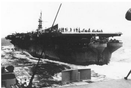
USS Sangamon The large object sticking up from the flight deck is the stern elevator after a Kamikaze hit. Somehow, she survived!