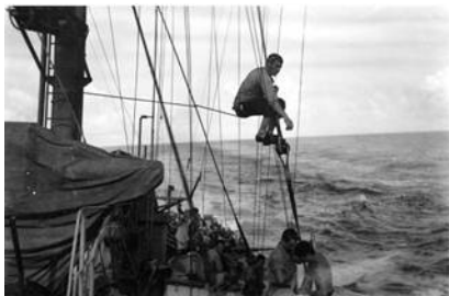
Hey guys! Are you sure this is my lookout station?