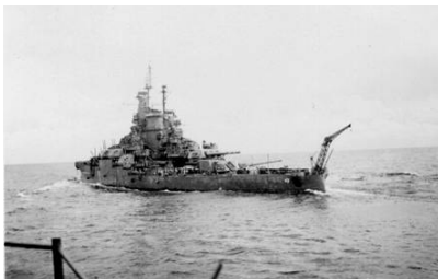
The Battleship Tennessee , a veteran of Surigao Strait, pulls away after refueling the Dennis .

The force that attacked Taffy III that day was one of two pincers that was to meet at Leyte Gulf, where the American invasion was taking place. Things went badly from the start for the Japanese as the Southern Force was all but annihilated in a night action in Surigao Strait, by battleships, cruisers, destroyers and PT boats, under the command of Jesse B. Oldendorf, who masterfully executed the classic "Crossing-the-T" maneuver.