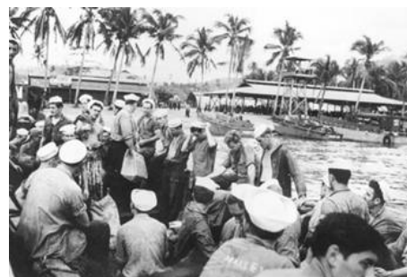
Nothing but beer, beaches, and baseball!