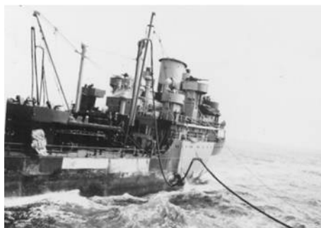
Refueling at sea from a Cimarron class tanker.