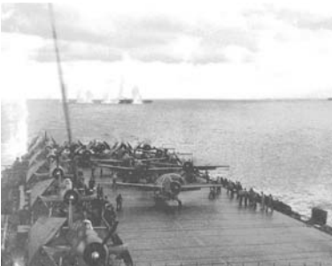
USS White Plains is bracketed by enemy fire (background) as the Kitkun Bay frantically scrambles aircraft.

It may have been divine providence, but as Taffy III turned south to avoid the onrushing Japanese, this actually brought the CVE's into the wind. It was a bizarre scene as ships belched smoke, multi-colored shell splashes enveloped the carriers, and deck crews frantically tried to arm aircraft with whatever was handy. Many planes attacked the enemy with depth charges, rockets, and finally nothing as they made "dry" runs over the enemy, hoping to distract them.