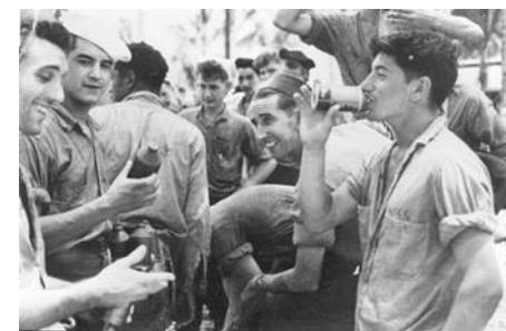
Hey! This stuff aint half bad!